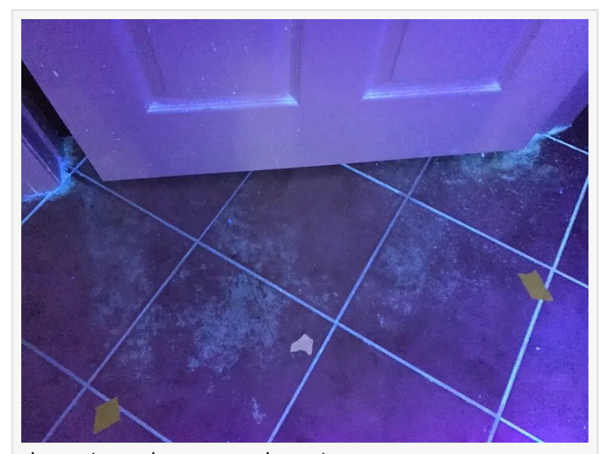
dog urine odor removal service

Most pet owners think that when a stain is gone, the smell vanishes. Regrettably, pet urine does not stay just on the surface as it traverses through the carpet fibers, gets absorbed by the padding, and finally, reaches the subfloor.