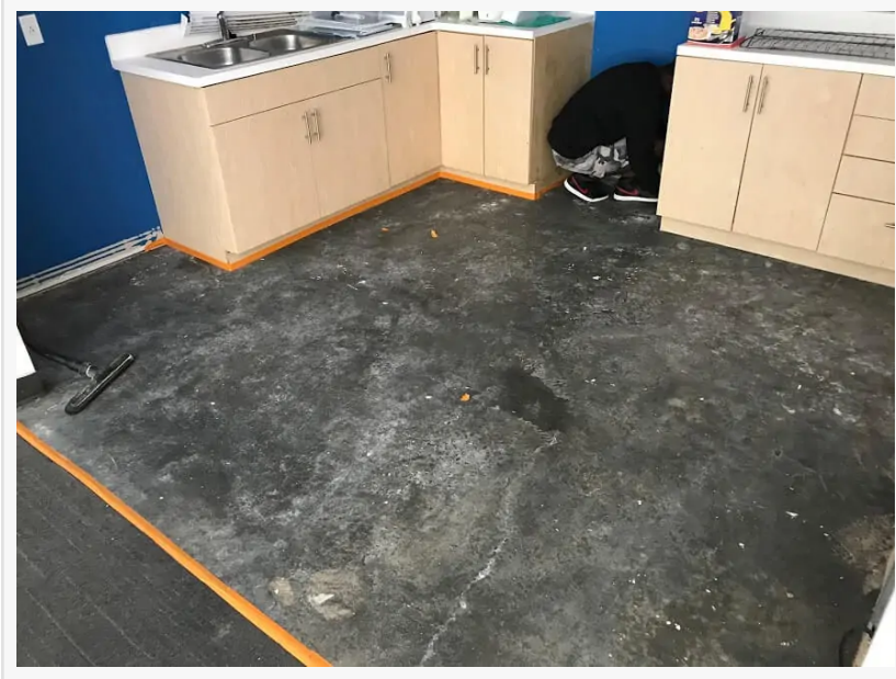
professional dog urine odor removal

Behind-the-Scenes: How the Experts Handle It