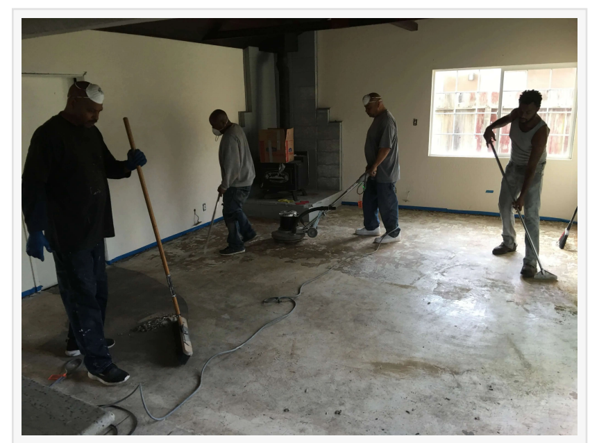
rodent urine odor removal - - -

Most homeowners are not aware of the amount of smell that can lurk away in several rooms. Urine is usually found