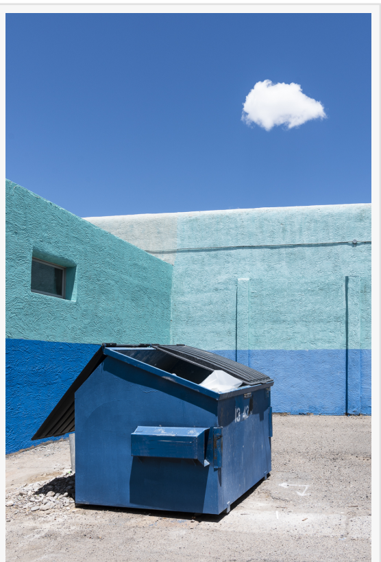
open to new ideas