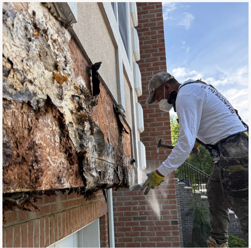
ZD Stucco Repair staff working on repairing the rotted plywood in the stucco system