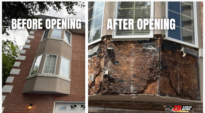
Before and after opening the stucco system