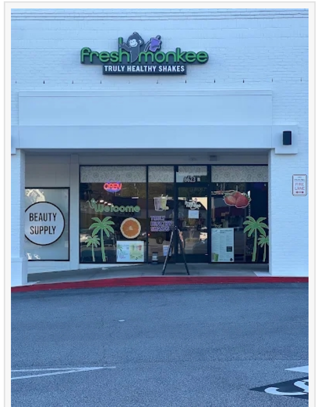
Fresh Monkee Sandy Springs

This press release can be viewed online at: https://www.einpresswire.com/article/835559875