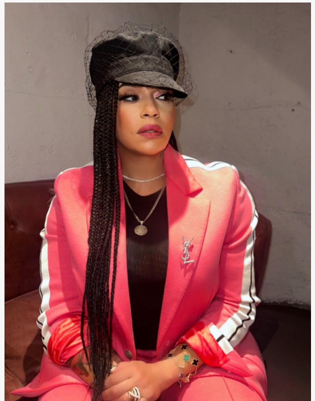
Founder and Chief Executive Officer Faith Evans

For the past 18 years, Faith Evans has spent most of her time caring for her son and family and advocating for autism spectrum disorder and other disabilities, hence the formation of her foundation, Ryder's Room Inc. "As many of my family, friends and business associates know, I am a mother first, there is nothing more important to me than my family," says the mother of four. "I've been on this journey with Ryder for more than 17 years, along with my newly adopted