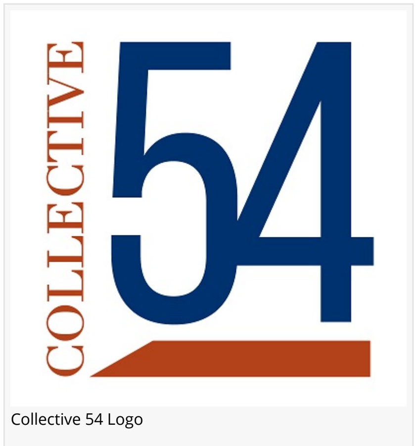
Collective 54 Logo