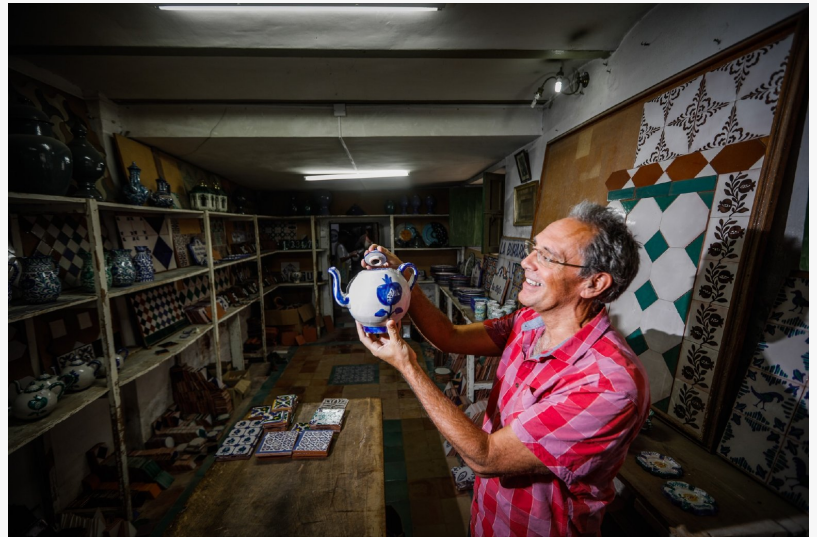
The Ceramic Record of Granada offers a heritage tour of ceramics, design, craft traditions, conservation at a historic Granada institution.

SAN FRANCISCO, CA, UNITED STATES, July 31, 2025 /EINPresswire.com/ -- Fernwayer, the curated travel experiences platform for culturally curious travelers, has launched a new series of private heritage experiences in partnership with Granada's legendary Fajalauza Foundation — guardians of one of Spain's oldest living ceramic traditions. While the Alhambra may be the reason travelers come to Granada, Fernwayer offers an afternoon detour into one of the city's most important living heritage sites, where preservation, craft, and cultural memory are still actively sustained.