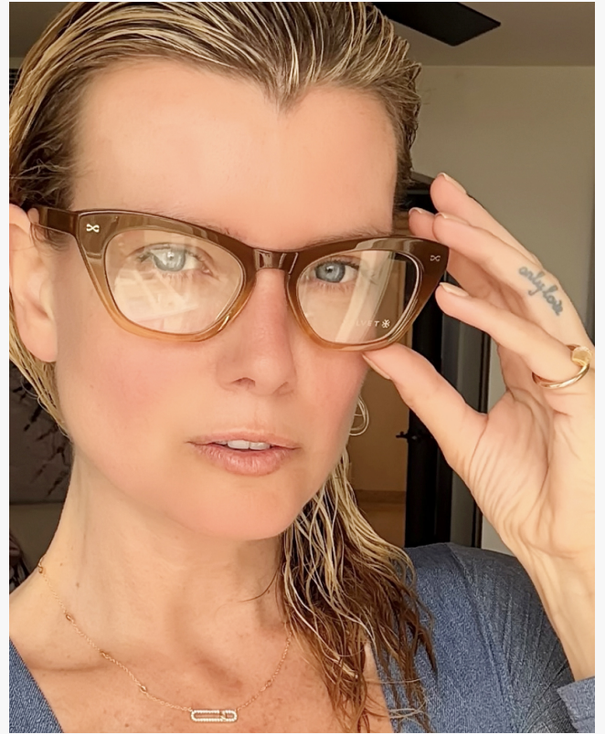
Actress/Model Eugenia Kuzmina Wears Velvet Eyewear

This press release can be viewed online at: https://www.einpresswire.com/article/835849907