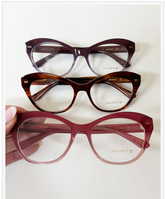
Velvet Eyewear Styles

Rooted in iconic American fashion and culture, Velvet blends timeless style, full UV protection, and modern comfort. Each style is hand-finished using high-quality materials, crafted in the finest factories, and proudly designed in the USA for women.