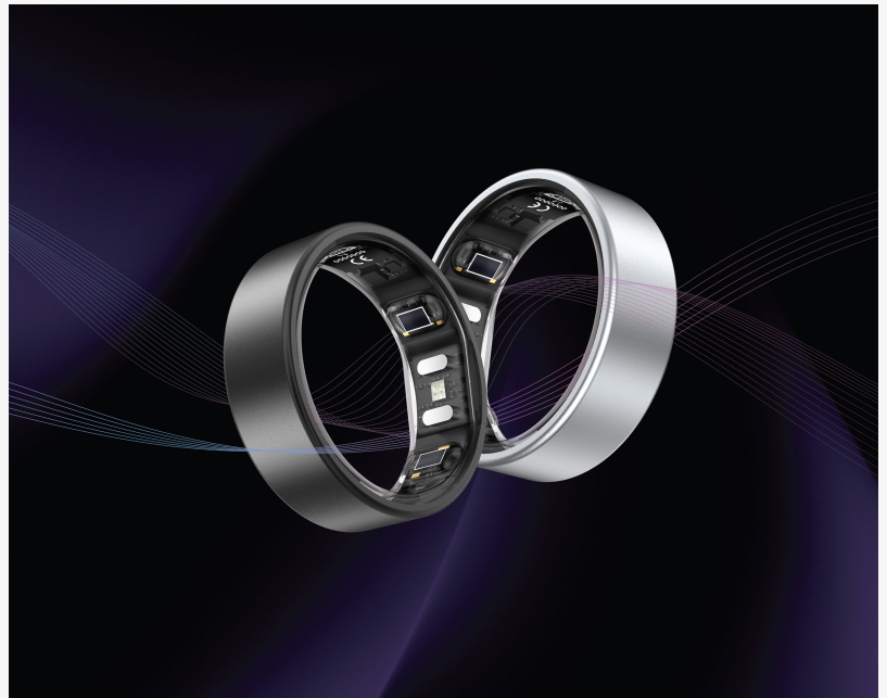
Actxa Core Smart Rings

Marking a new chapter in Actxa's journey to empower healthier living, the Core Smart Ring is designed for all-day comfort and seamless integration. Sleek, featherlight, and packed with meaningful insights, it weighs just 2.5 to 3.3 grams*, offering powerful performance in a minimalist form. The ring seamlessly syncs with the Actxa App, allowing users to access detailed health analytics all in one intuitive platform effortlessly.