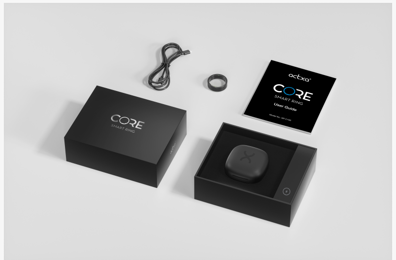
The Actxa Core Smart Ring Kit