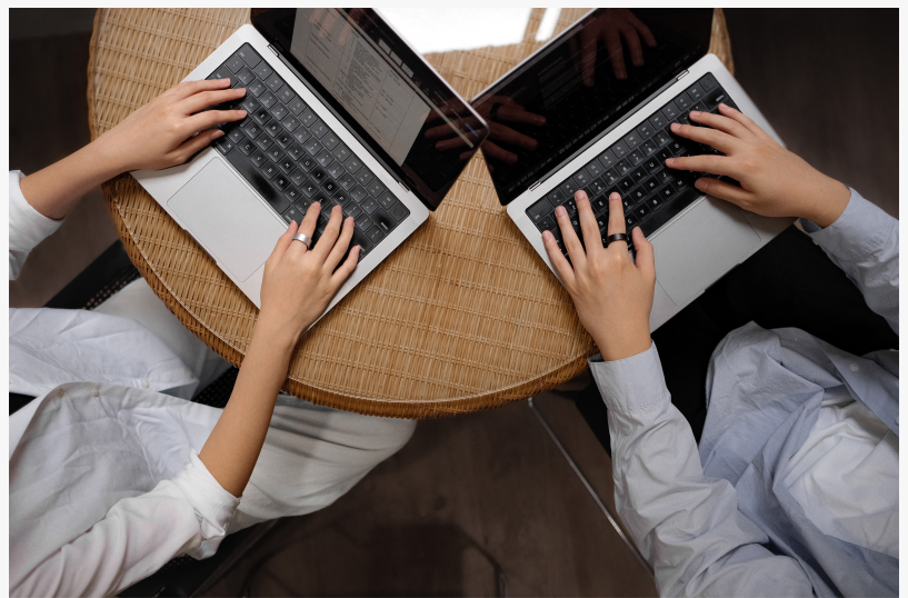
Actxa Core Smart Ring for comfort and efficiency

Headquartered in Singapore, Actxa Pte Ltd is a deep tech company founded in 2015 that leverages artificial intelligence to create next-generation preventive healthcare solutions.