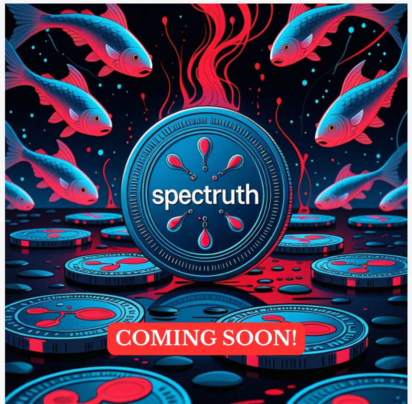
Spectruth DAO Token