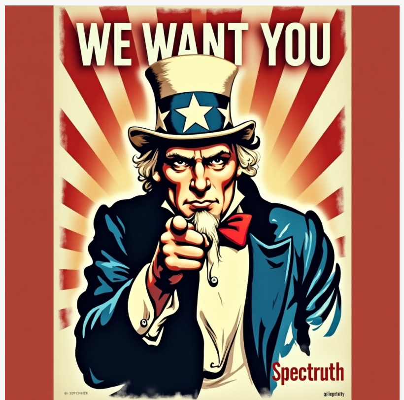
We Want You