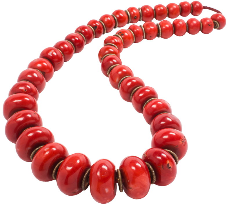
An exceptionally rare Tibetan red coral bead necklace (Estimate: $100,000 / 150,000)

Talesa Eugenio Clars Auctions +1 510-428-0100 talesa@clars.com