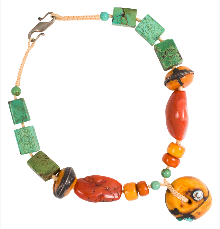
A Sino-Tibetan amber, carnelian and turquoise necklace (Estimate: $1,000 / 1,500)

This press release can be viewed online at: https://www.einpresswire.com/article/836190407 EIN Presswire's priority is source transparency. We do not allow opaque clients, and our editors try to be careful about weeding out false and misleading content. As a user, if you see something we have missed, please do bring it to our attention. Your help is welcome. EIN Presswire,