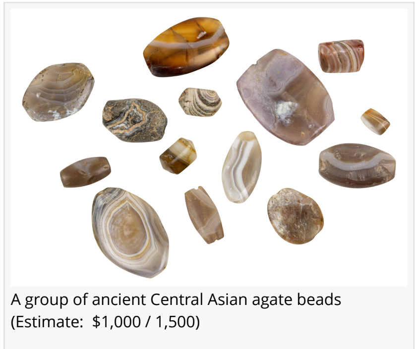
A group of ancient Central Asian agate beads (Estimate: $1,000 / 1,500)