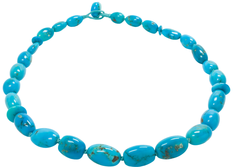
A fine Persian turquoise bead necklace (Estimate: $3,000 / 5,000)