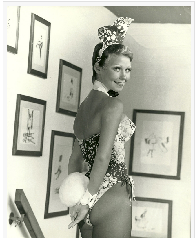
At the St. Louis Playboy Club

https://www.candidcandace.com/my_weblog/about-candace.html ; To learn more about the exhibit and the Chicago History Museum, please visit https://www.chicagohistory.org or Email: media@chicagohistory.org