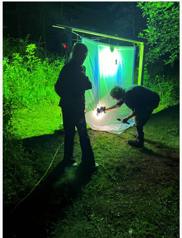
An after-dark safari at Butterfly Ridge in Ohio's Hocking Hills introduces visitors to the nocturnal exploits of stunning moths.

Through Labor Day, fortunate (and quiet) visitors to Lake Hope State Park have the unforgettable