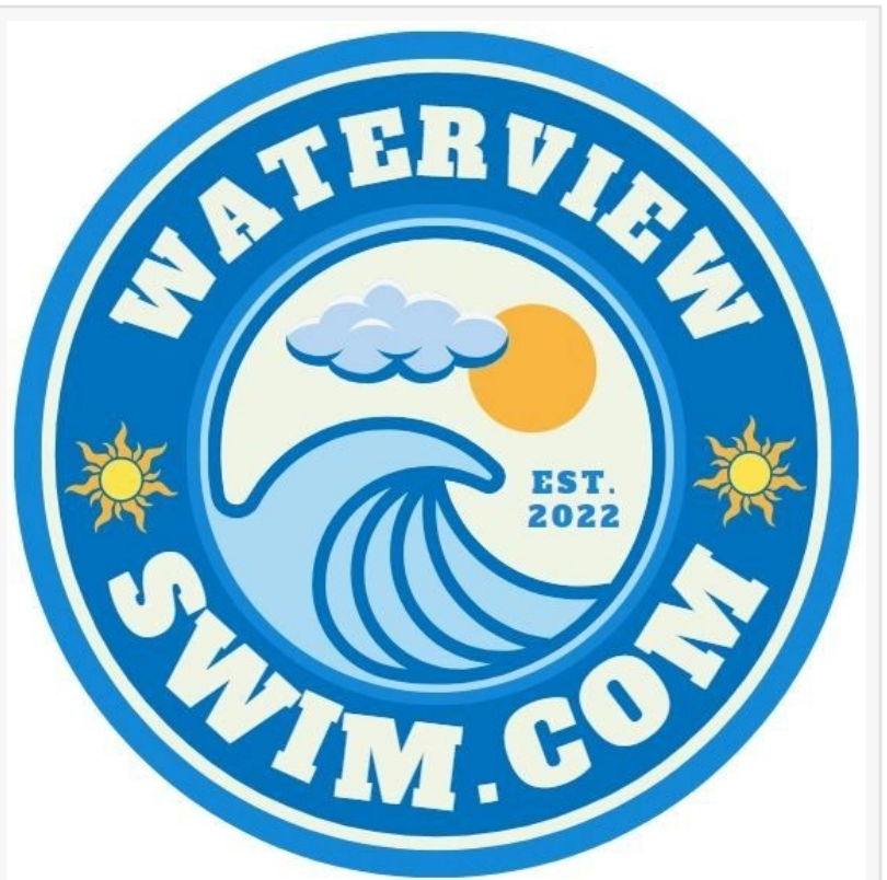
Waterview Swim Logo