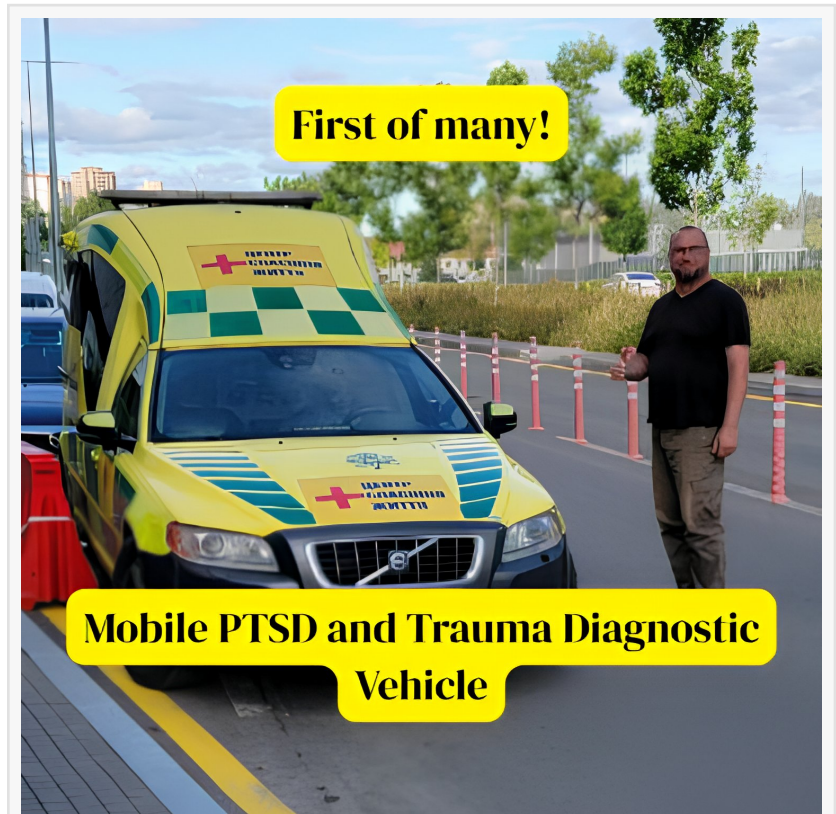
First deposit made towards Spectruth's mobile unit

By deploying this mobile clinic, Spectruth breaks new ground in delivering decentralized health services—offering on-site, scientifically rigorous PTSD