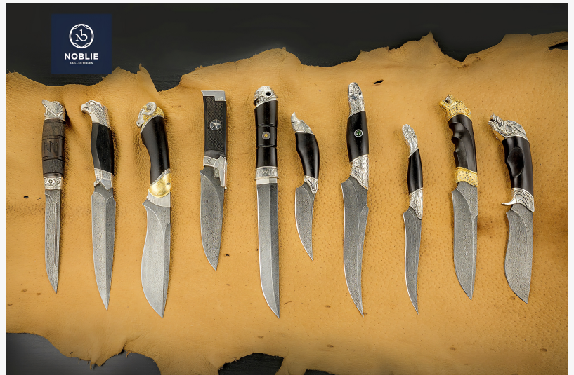
Noblie Custom Knives

Beluga Damascus Knife — A sleek, fish-themed fixed blade that marries silver-plated brass fittings to an ebony grip. Overall length is a compact 225 mm, making it an approachable daily carry for owners who actually use their art pieces.