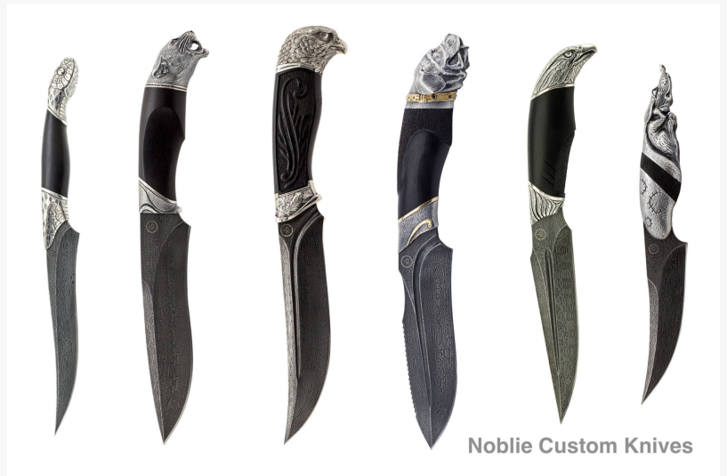
Damascus knives by Noblie