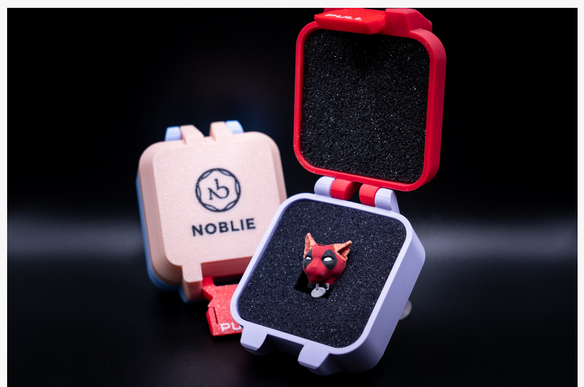
plastic paracord beads

Strict Limited Edition – Runs are capped at 50 pieces per design. Once a mold wears out or the paint batch is gone, that variant retires.