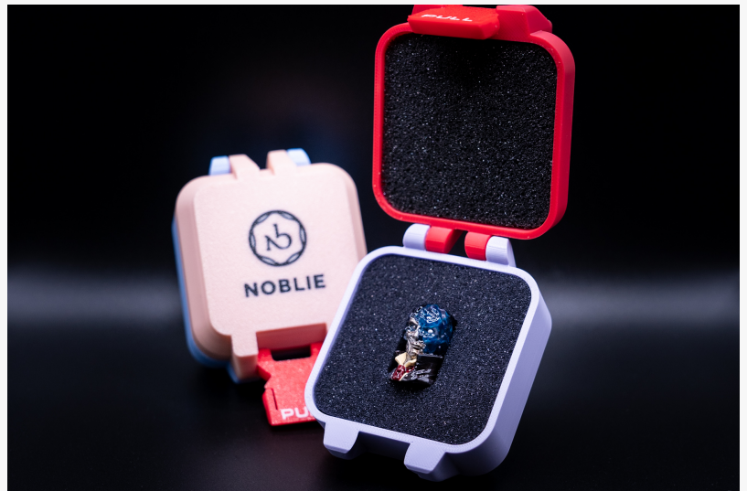
custom EDC beads

Pop-Culture Nods Without the Licensing Headache – From frost-masked warriors and cosmic