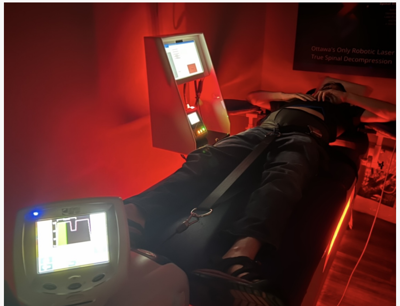
Robotic Laser Spinal Decompression Treatment