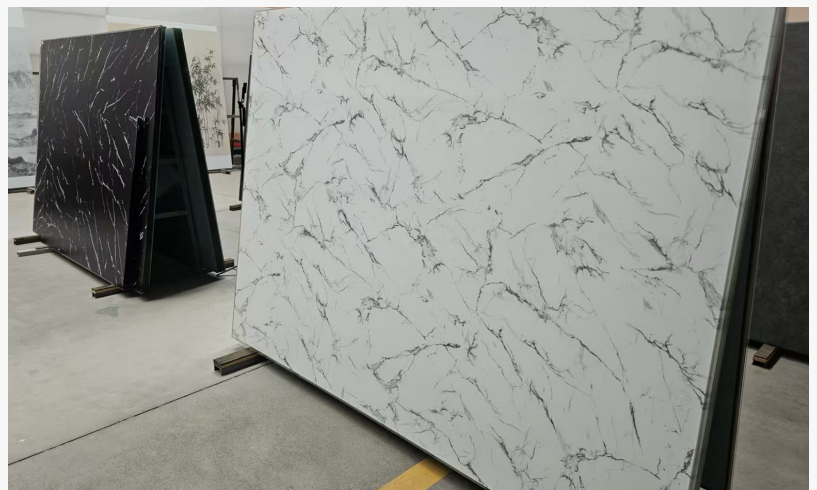
Morn BM-Cuttable printed glass