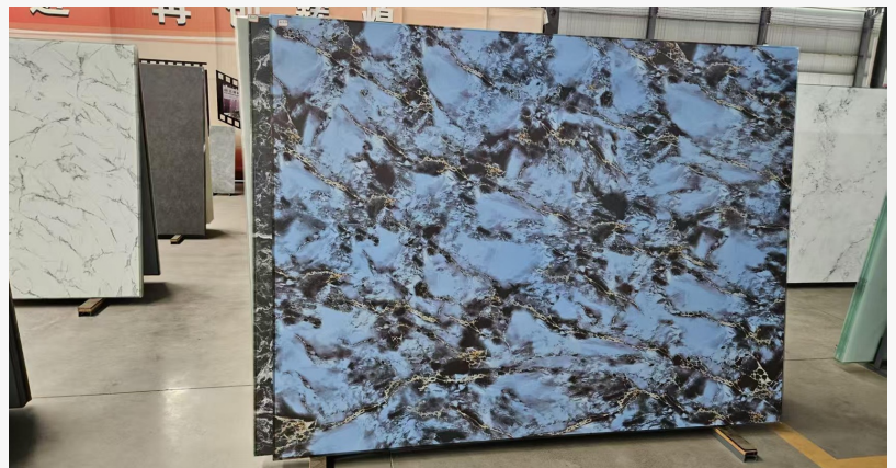
Morn BM-Cuttable digital printed glass