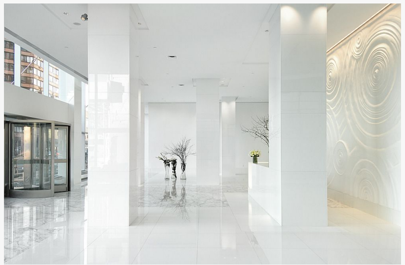
Atelier Condo NYC Lobby

But energy efficiency is only one layer of Neiditch's comprehensive vision for the property. Luxury at The Atelier goes well beyond the traditional expectations of high-end real estate. The building offers an unparalleled array of amenities designed to elevate every aspect of residents' lives. From a rooftop ice-skating rink and basketball court to a state-of-the-art fitness center, daily breakfast, indoor and outdoor swimming pools, yoga studio, and 47th floor Sky Lounge, The Atelier doesn't just cater to comfort—it caters to lifestyle. Each amenity is thoughtfully curated to provide convenience, entertainment, and wellness, making it possible for residents to enjoy a resort-like experience without leaving home.