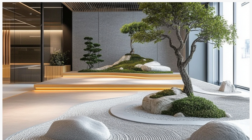
Indoor Zen Garden Project by Green Zen