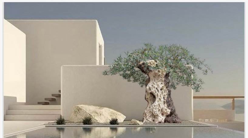
Green Zen Garden Project Dubai

luxury villas, penthouses, wellness centers, and corporate offices, Green Zen is redefining interior design by bringing nature into the heart of urban living.