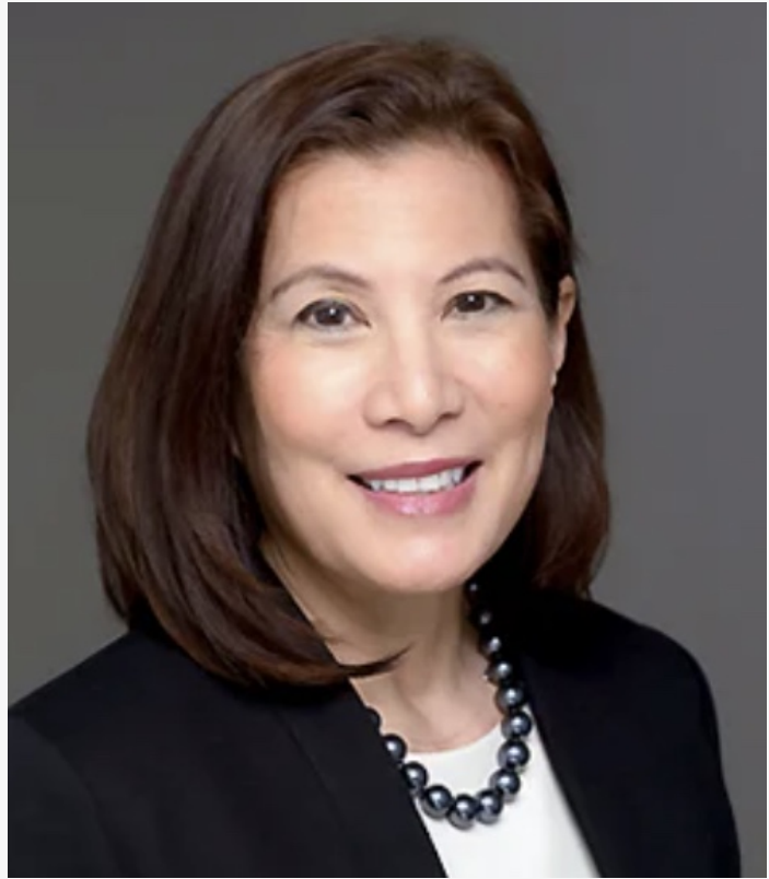
CEO Tani Cantil-Sakauye

As stated by PPIC, "the organization believes in the power of good information to build a brighter future. We pride ourselves on the independence and rigor of our peer-reviewed work. And even when our findings are unexpected or controversial, we believe in letting the facts speak for themselves. PPIC encourages civil, productive dialogue that inspires sustainable policy solutions in Sacramento and around the state. Our events feature viewpoints across the political spectrum, promoting constructive, thoughtful, and respectful discussions about the issues that matter most to California. Above all, we are committed to a nonpartisan approach in all aspects of our work."