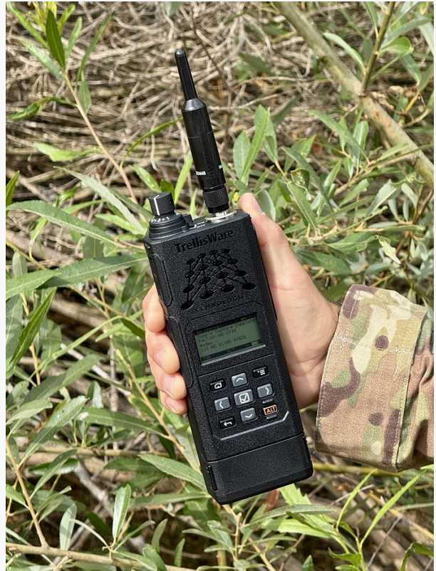
TrellisWare TW Shadow 750 Radio