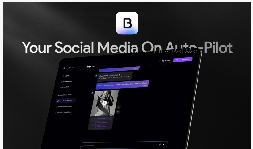
Generate Social Media Content with AI

For more information about Bupple Version 2, visit [https://bupple.io](https://bupple.io) .