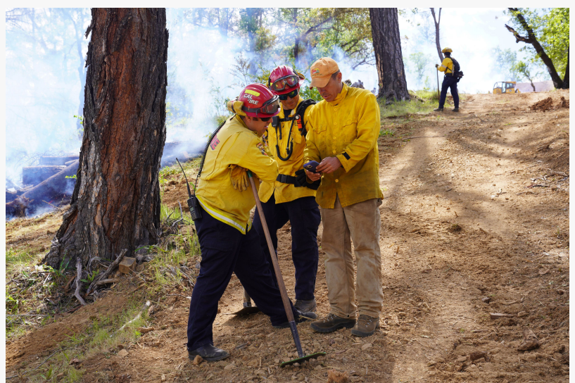
Firefighters and land managers review digital maps during a prescribed burn operation in Napa County. Technology-supported planning is a critical component of the Valley Stewards Initiative.

The initiative will develop 100 Enhanced Resilience Sites over the next decade which will include hundreds of participating landowners. By mapping important work that is already completed and assisting landowners to make additional investments, these mapped landscapes become actionable intelligence for firefighters and serve dual roles, protecting people, homes, and critical infrastructure while conserving native ecosystems, supporting wildlife corridors, and