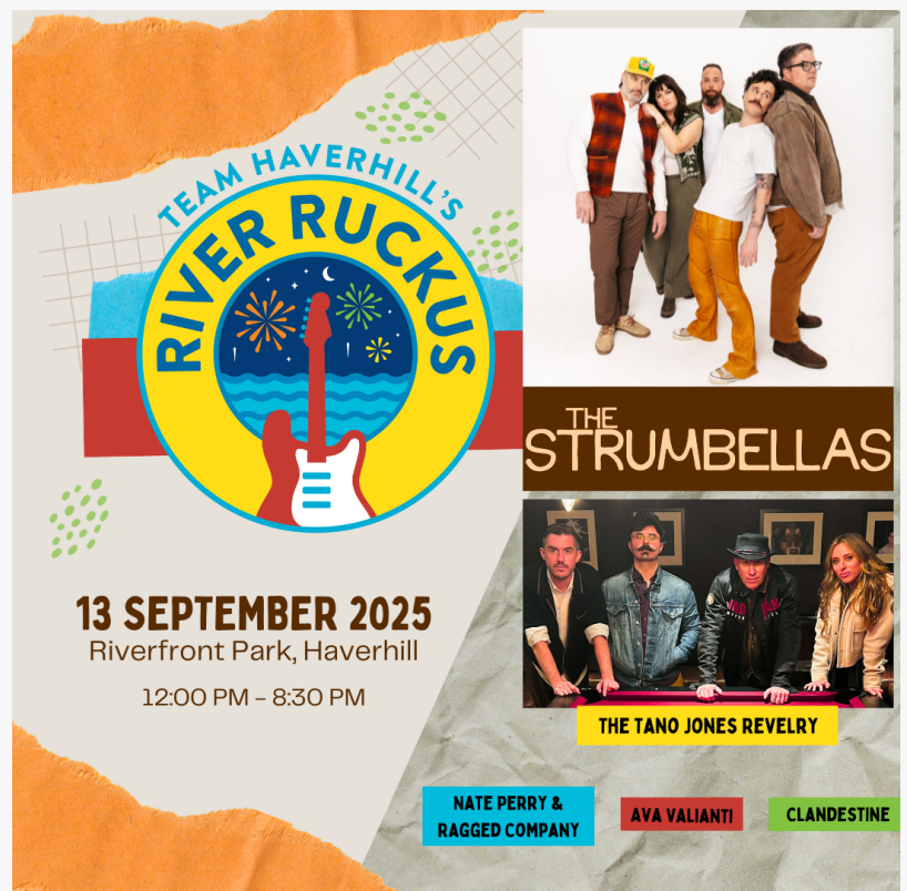
River Ruckus - Haverhill, MA - 2025 Lineup