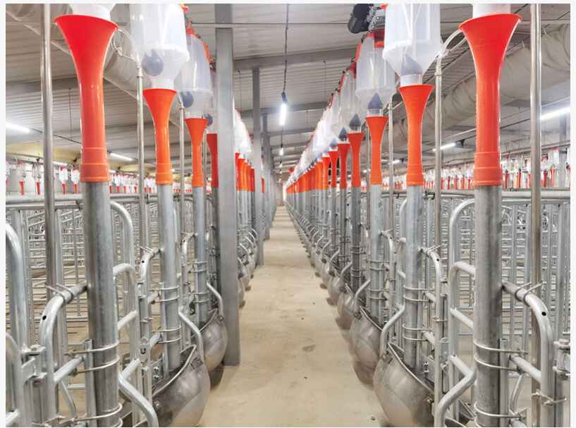
CX Livestock: China's Leading Manufacturer of Livestock and Construction Equipment Expands Global Reach

/EINPresswire.com/ -- CX Livestock , a premier Chinese manufacturer, delivers advanced solutions for livestock husbandry and construction industries worldwide. With over two decades of expertise in manufacturing high-quality fences, barriers, brackets, supports, and scaffolding, CX Livestock has earned a reputation for reliability, precision, and customer-focused service. As a trusted OEM, ODM, and OBM manufacturer, the company provides tailored solutions to meet the specific needs of livestock farms and construction projects. This press release highlights CX Livestock's exceptional product offerings, brand strengths, and strategic expansion into European and American markets, showcasing its dedication to quality and advancement.