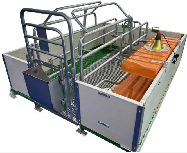
CX Livestock: China's Leading Manufacturer of Livestock and Construction Equipment Expands Global Reach

CX Livestock's success is driven by its dedication to advancement. The company invests significantly in research and development to create cutting-edge products that meet evolving industry needs. By leveraging advanced manufacturing technologies, such as automated production lines and precision engineering, CX Livestock ensures its products remain at the forefront of quality and performance.