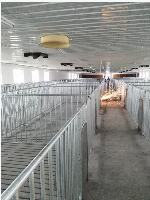
CX Livestock: China's Leading Manufacturer of Livestock and Construction Equipment Expands Global Reach