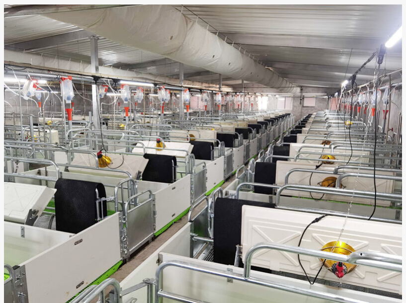
CX Livestock: China's Leading Manufacturer of Livestock and Construction Equipment Expands Global Reach

CX Livestock excels in providing customized solutions through its OEM, ODM, and OBM services. Whether a livestock farm requires specialized fencing designs or a construction project demands tailored scaffolding, CX Livestock collaborates closely with clients to deliver products that meet specific requirements. The company also incorporates eco-friendly materials and sustainable manufacturing processes, appealing to environmentally conscious buyers in Western markets. This focus on customization and sustainability ensures that CX Livestock's products are both practical and forward-thinking. For instance, the Sow Farrowing Crate have obtained environmental protection patents.