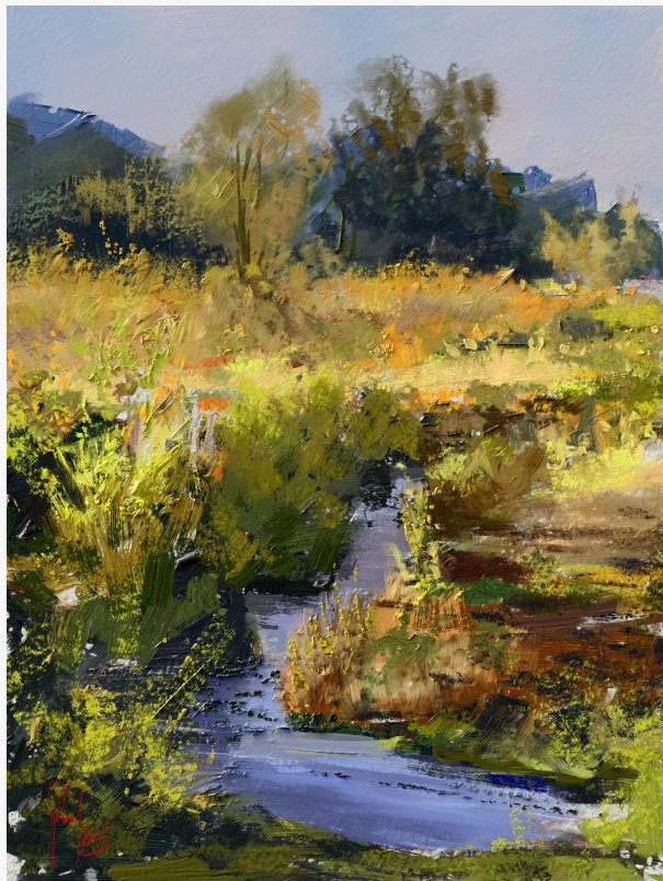
Landscape by Georg Ireland, Painted in Rebelle 8 Pro