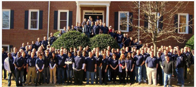
Students of CED Solutions attending Certification training

BOZEMAN, MT, UNITED STATES, August 5, 2025 /EINPresswire.com/ -- As cyber threats continue to escalate in scale, frequency, and complexity, CED Solutions, LLC, a premier provider of IT training and certifications, is reinforcing its position as a national leader in cybersecurity education for businesses, government agencies, and military personnel.