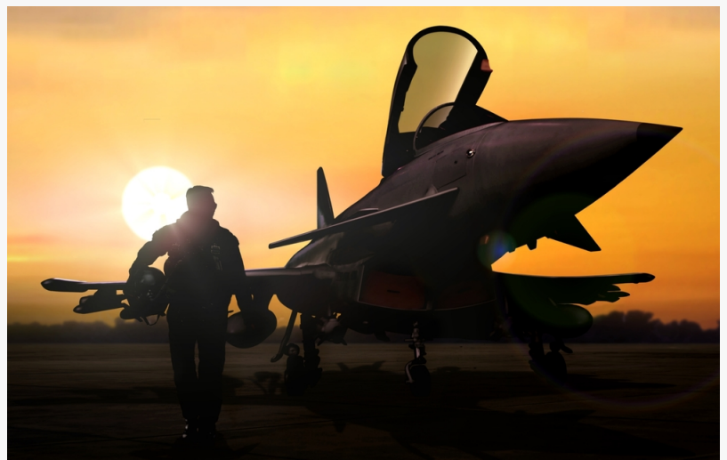
Military required DoD 8570 and 8140 training through CED Solutions

With the cybersecurity talent gap exceeding 3.4 million professionals worldwide, CED Solutions is helping close the skills shortage through accelerated training, veteran-friendly programs, and flexible online and in-person learning formats.