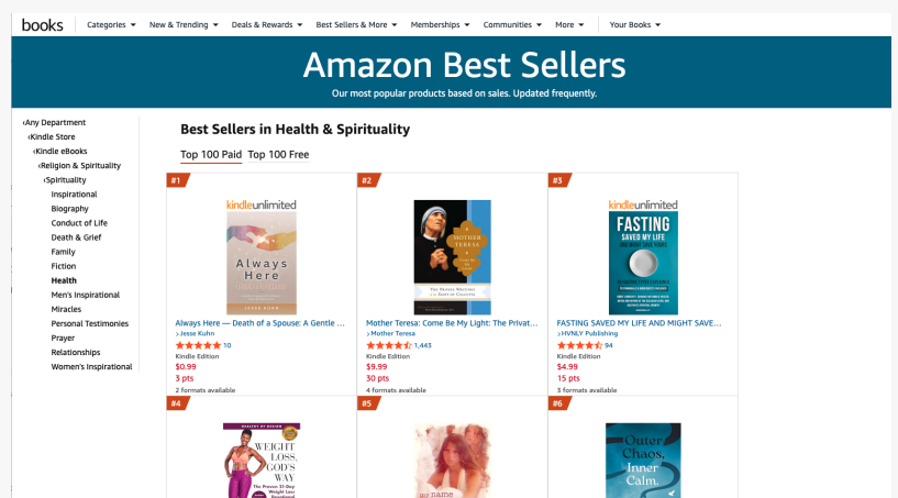
Amazon Best Seller Always Here - Death of a Spouse