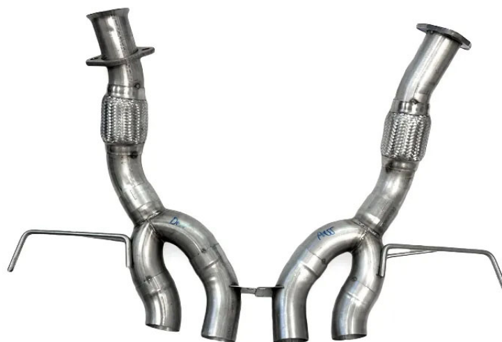
Top View of MRT 304 Stainless Cat-back C8 Z06 91S226

MRT designed the Street Race catback as a direct-fit installation that utilizes the rear bumper faux quad tips while retaining all factory emission components. The comprehensive installation process takes approximately six hours and requires the removal of the Z06 rear bumper to access the stock exhaust system. Due to the complexity of the installation, MRT recommends professional installation and offers installation services at their Plymouth, Michigan facility.