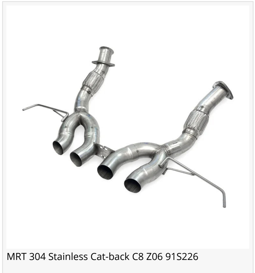
MRT 304 Stainless Cat-back C8 Z06 91S226

"The Chevy Z06 package is a beast and a high-performing machine that offers great track experiences," said Scott Hoag, CEO of MRT Performance. "At MRT, we decided to transform this race car into an absolutely wicked machine with an exotic race car sound. An upgraded Z06 with the MRT Street Race exhaust telegraphs how wild your Corvette ride is about to get. If you're a