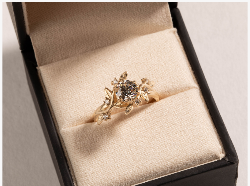
Ring from retórica's "Forrest Goddess" collection