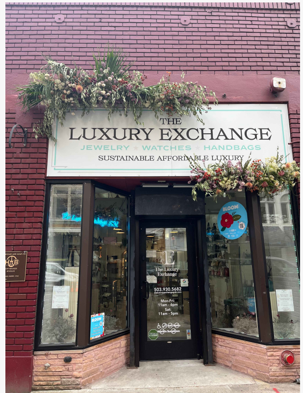
Exterior of The Luxury Exchange