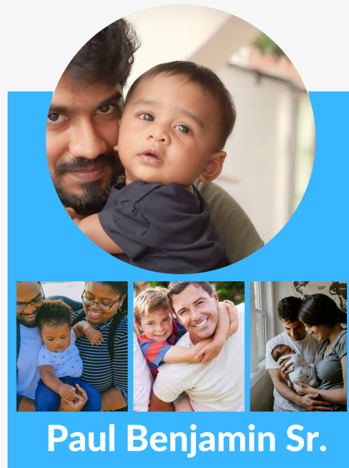
Breaking The Father Code