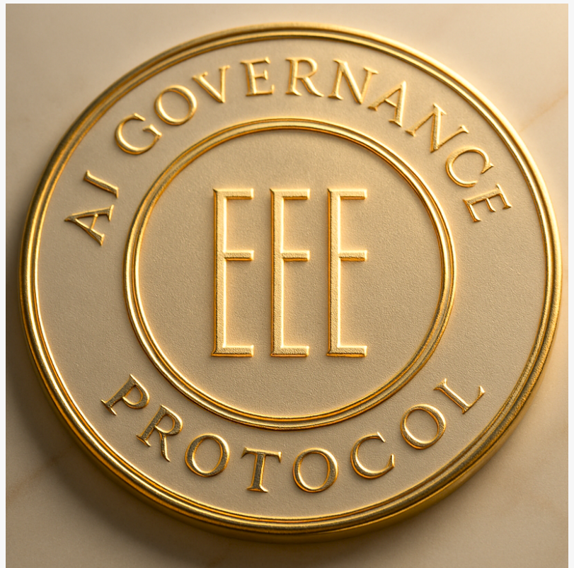
AI Governance for Licensed Professionals and Regulated Industries - EEE AI Governance Protocol

CHICAGO, IL, UNITED STATES, August 6, 2025 /EINPresswire.com/ -- The MedLegal Professor™ (TMP) today issued a national enforcement alert with urgent implications for regulators, malpractice underwriters, professional associations, and institutional leaders; Regulated professionals and organizations in law, healthcare, finance, insurance, real estate, and other high-risk sectors must implement audit-ready, enforcement-grade AI governance protocols before automating any workflow or decision system to protect those they serve, safeguard institutional integrity, and prevent legal, financial, and ethical exposure.