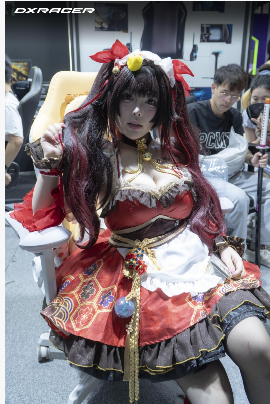
DXRACER ChinaJoy Coser3