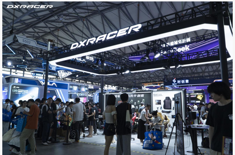
DXRACER ChinaJoy Booth

WHITMORE LAKE, MI, UNITED STATES, August 6, 2025 /EINPresswire.com/ -- DXRACER , the global pioneer in the gaming chair category, has officially announced its participation in the 2025 China Joy exhibition. The exhibition was held from August 1st to 4th at the Shanghai New International Expo Center. DXRACER's booth is located at S507, Hall E7, and invites gamers, esports enthusiasts, and industry partners to join us for a feast of technology and trends.