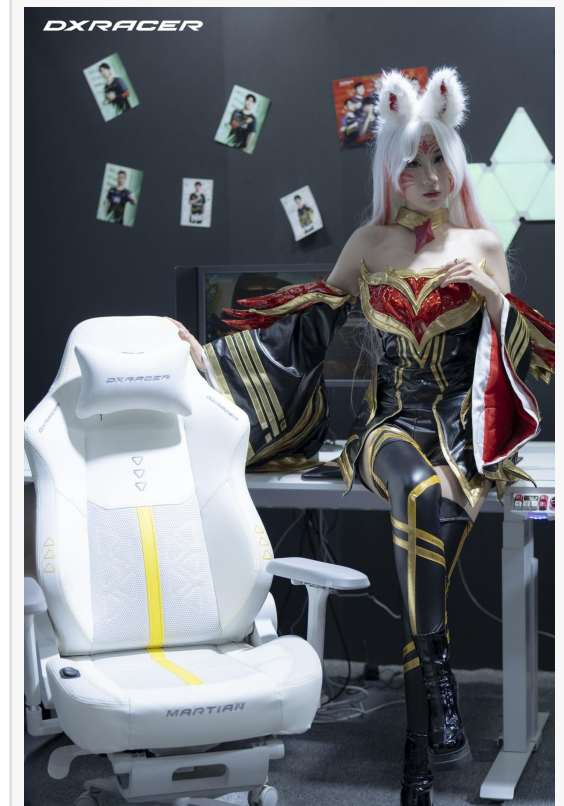
DXRACER ChinaJoy Coser2