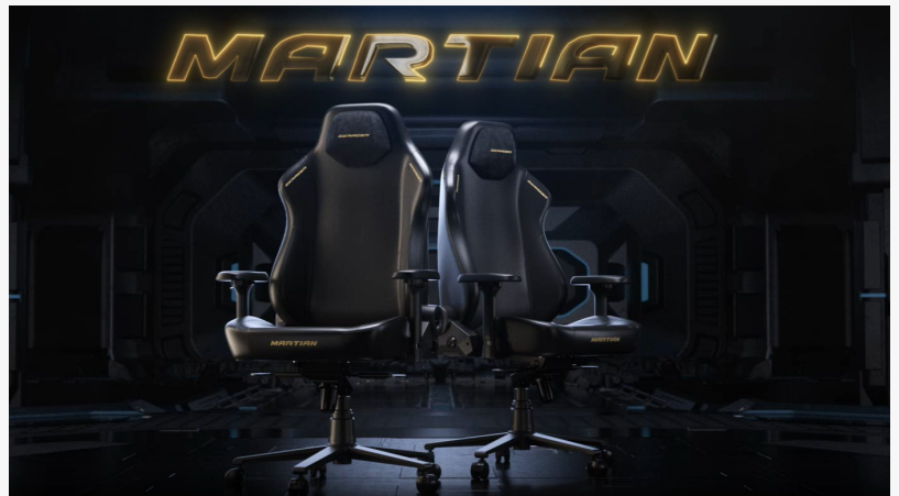
DXRACER ChinaJoy Martian Series

This press release can be viewed online at: https://www.einpresswire.com/article/837108448