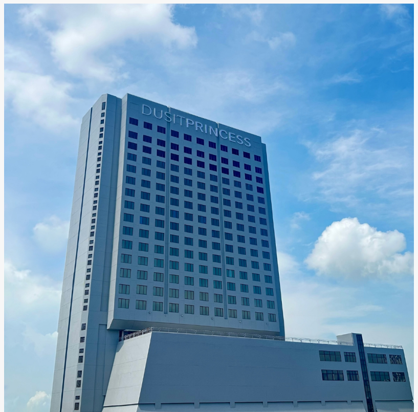
Dusit Princess Melaka wins two prestigious accolades at the International Business Magazine Awards 2025

The Excellence in Regional Hospitality – Malaysia 2025 accolade, meanwhile, was awarded in