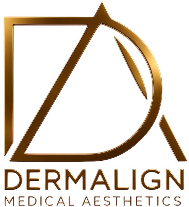
DermAlign Medical Aesthetics