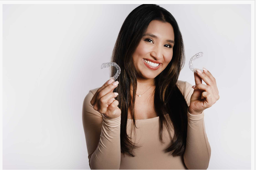
CandidPro Clear Aligners

The introduction of CandidPro reflects Beyond Dental Care’s commitment to modernizing dental care for patients in Upper West Side Phoenix, North Glendale, and North Peoria. As dental patients increasingly prioritize convenience and transparency, practices are moving toward digital-first orthodontic solutions.