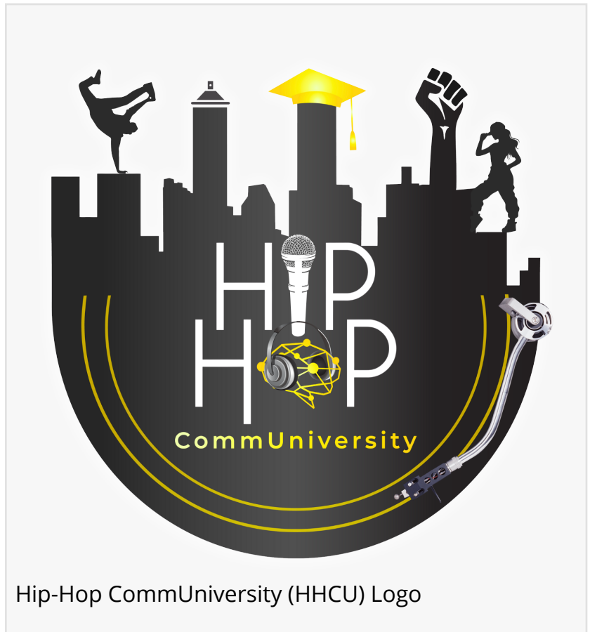
Hip-Hop CommUniversity (HHCU) Logo

Now relaunched in collaboration with Hip Hop Congress and platform designer NovaWorks Corp, HHCU offers a dynamic learning hub through music, dance, visual art, storytelling, entrepreneurship, technology, and civic engagement, HHCU empowers learners of all ages to lead with creativity, critical consciousness, and purpose.