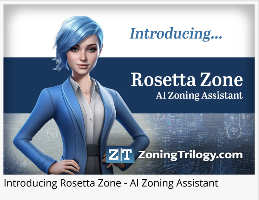
Introducing Rosetta Zone - AI Zoning Assistant

ZoningTrilogy.com is highlighting how its new AI assistant, Rosetta Zone , is transforming the once tedious task of looking up zoning definitions. Urban planners and zoning officers routinely need to verify the meaning of terms – from “floor area ratio” to “accessory dwelling unit” – often across different by-laws or ordinances. Rosetta Zone now allows professionals to obtain official zoning definitions in seconds just by asking, eliminating the need to flip through multiple reference books or PDF documents.