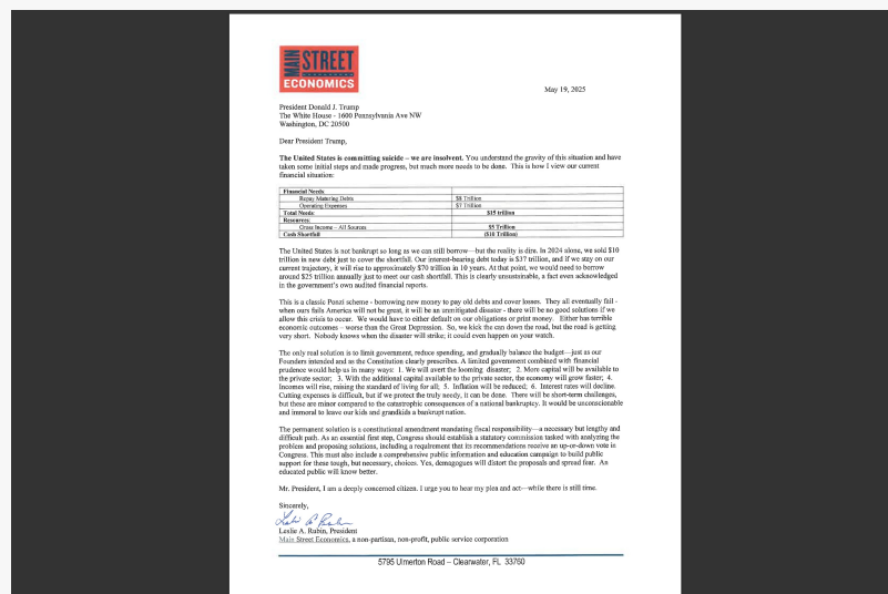
Main Street Economics Open Letter to President