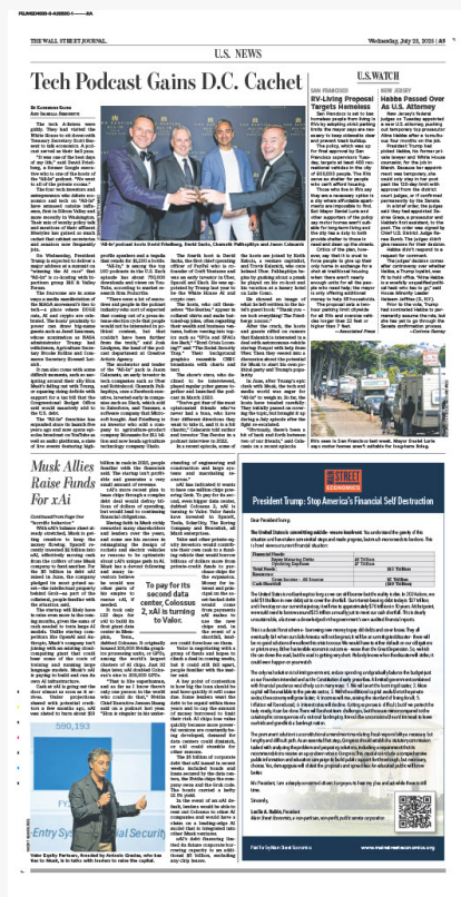
Main Street Economics Ad in WSJ