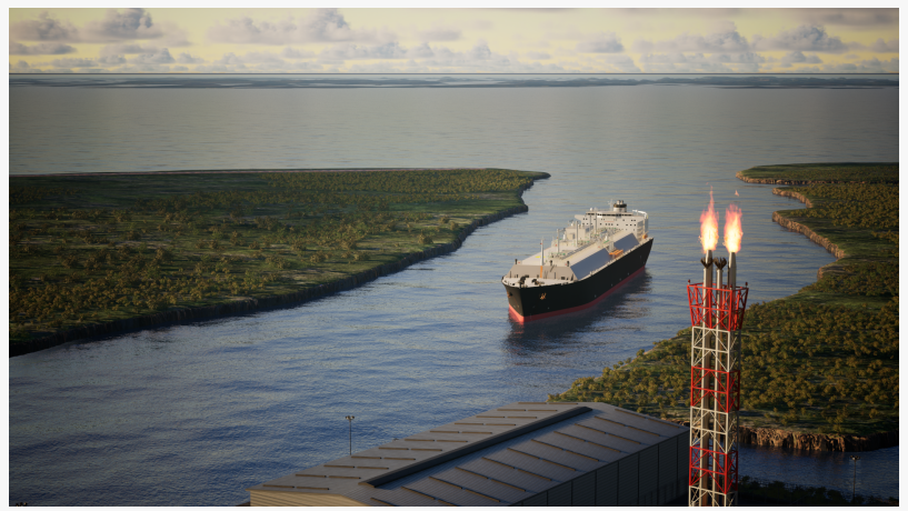
Argent GTT Ships Entering Port Fourchon

Argent LNG is a next-generation liquefied natural gas exporter committed to delivering reliable, secure, and responsible American energy to global markets. Leveraging Louisiana’s energy heritage and innovation, Argent LNG is building the infrastructure needed to power a sustainable energy future and strengthen global partnerships. Learn more at www.argentlng.com .