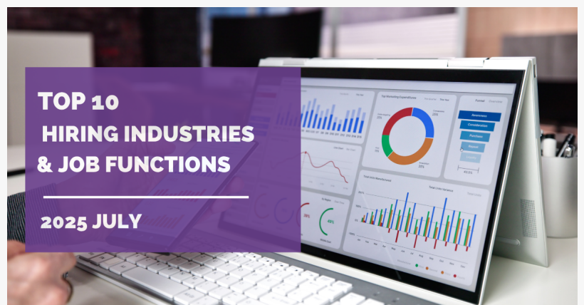
JobNet.com.mm July hiring insights - COVER

The list below highlights the top 10 job functions with the most job postings on JobNet.com.mm for July 2025. Whether you're seeking to expand your team, streamline your workforce, or stay ahead in the talent acquisition game, these insights will help you make informed decisions