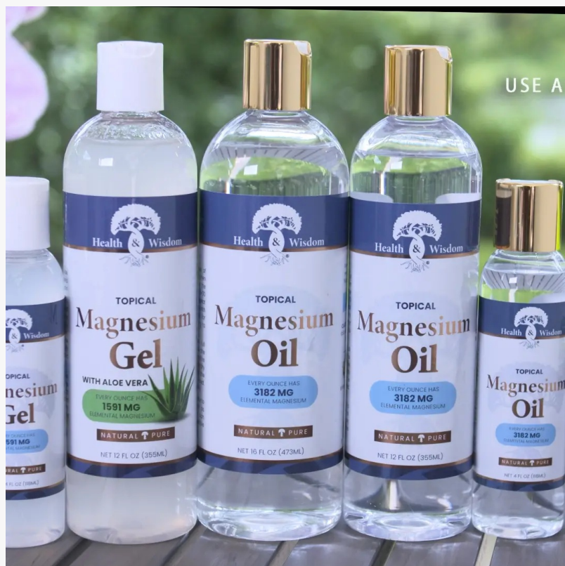
Health and Wellness Magnesium Oil--