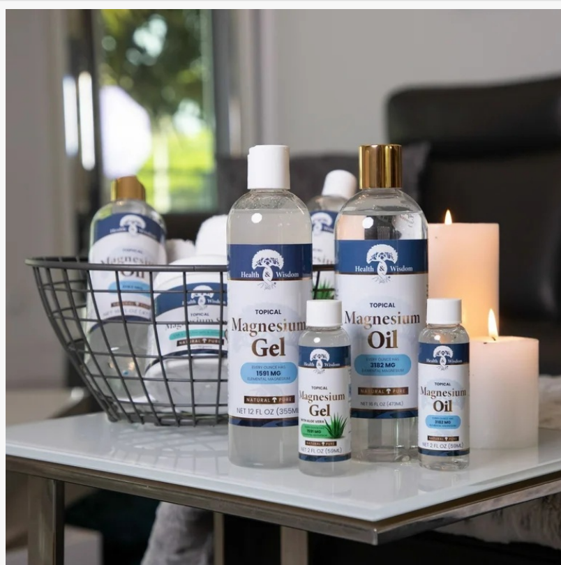
Topical Magnesium Oil ---