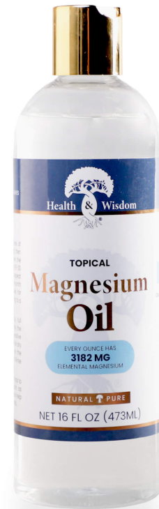
Best Magnesium Oil

With the growing interest in natural health solutions, the demand for topical magnesium oil has increased. The company's latest product updates reflect this trend, focusing on ease of use and quality of ingredients.