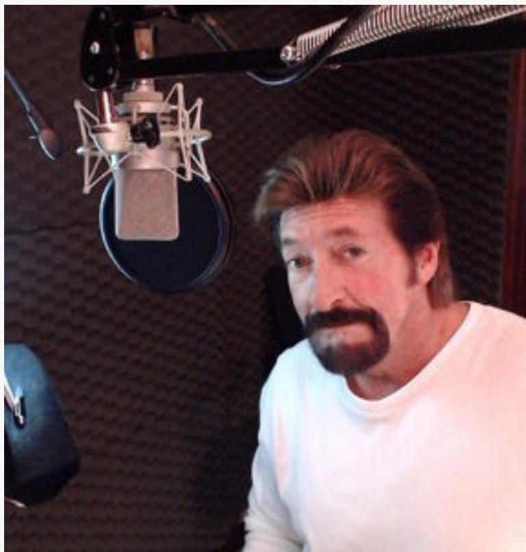
promo voice over services.