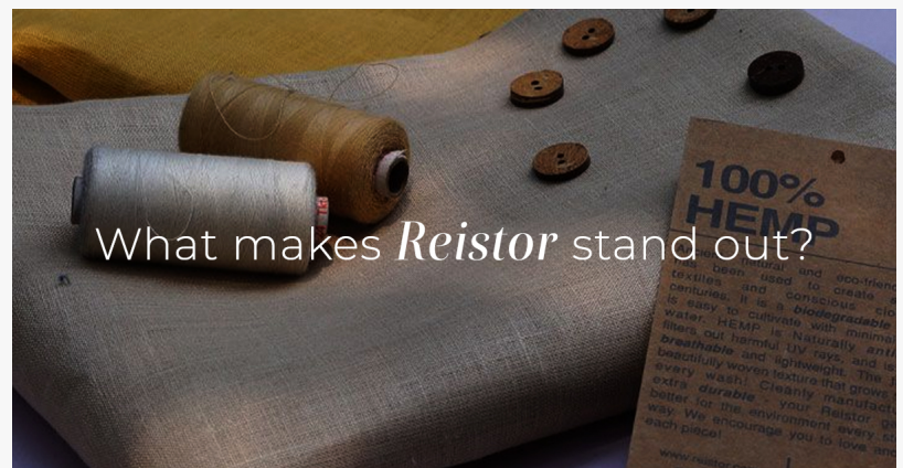
what makes reistor stand out