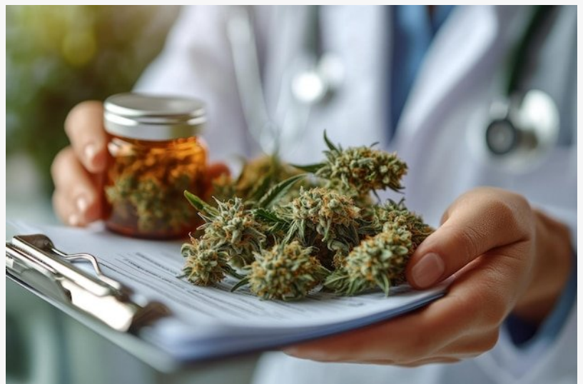
MMJ Card Renewal