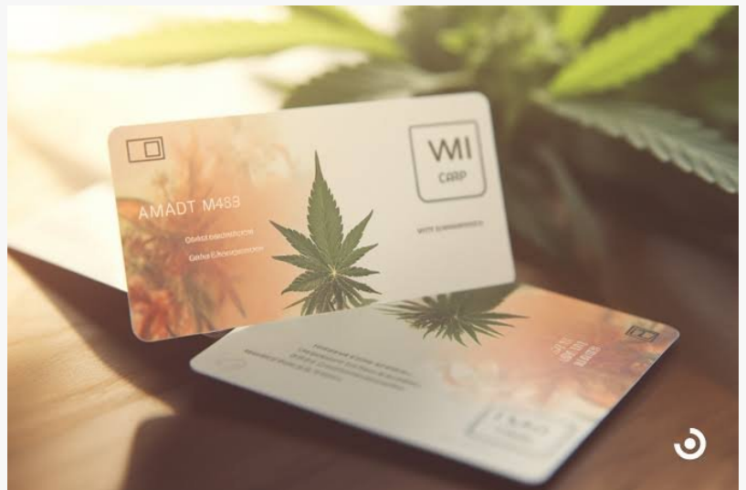
MMJ Card Renewal Online