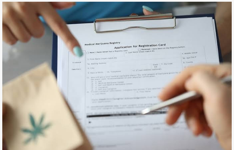
MMJ card renewal near me

Renewing an MMJ card is a necessary step for continued legal access to medical cannabis. Many patients report that online renewal offers a more efficient and stress-free experience. When