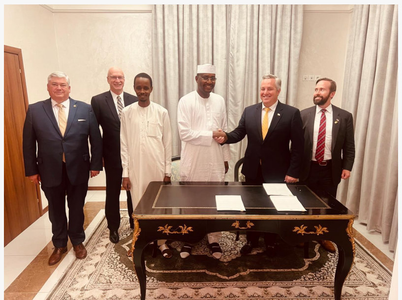
USCD Delegation and Republic of Chad Celebrate Mineral Agreement Signing