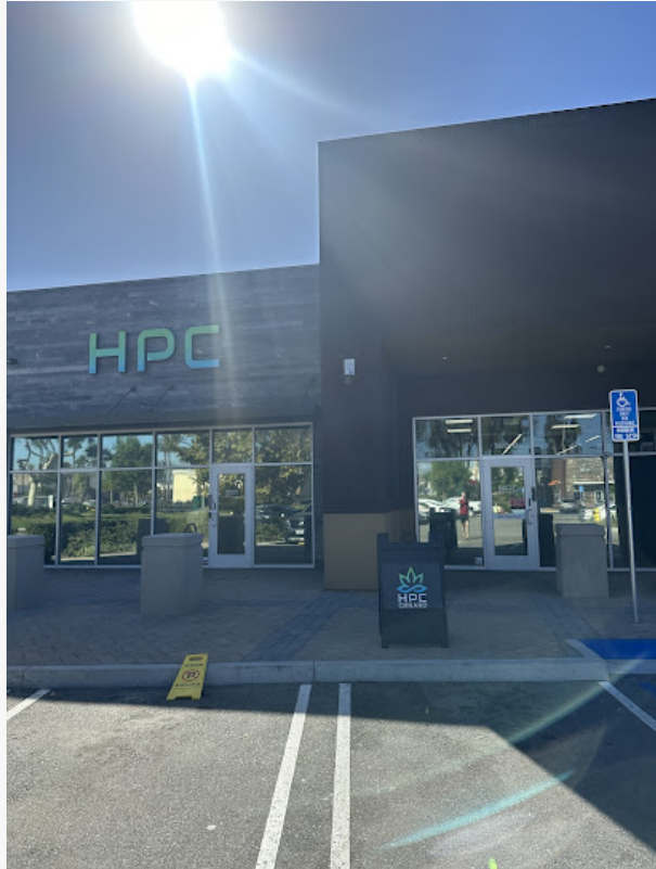
HPC Dispensary Oxnard