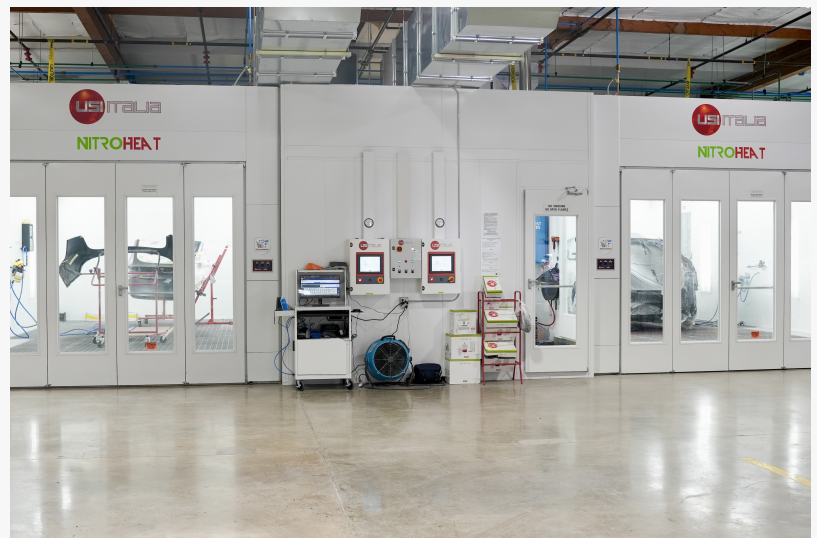
New spray booths at Exotic motors